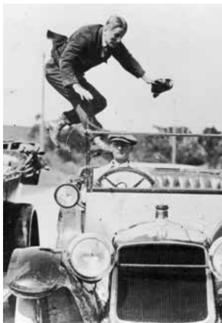
'Snowy' Baker jumps from car to car in The Enemy Within (1918), directed by Roland Stavelly.