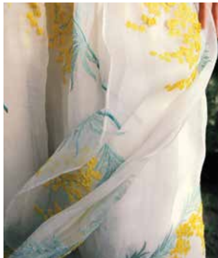
Fashions of the Western District - an example of work