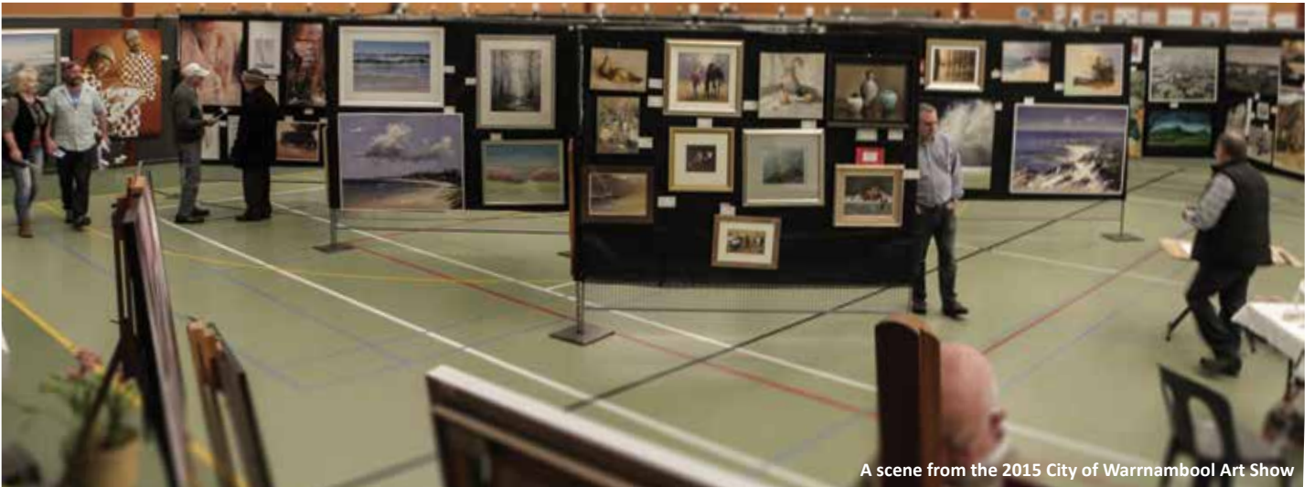
A scene from the 2015 City of Warrnambool Art Show